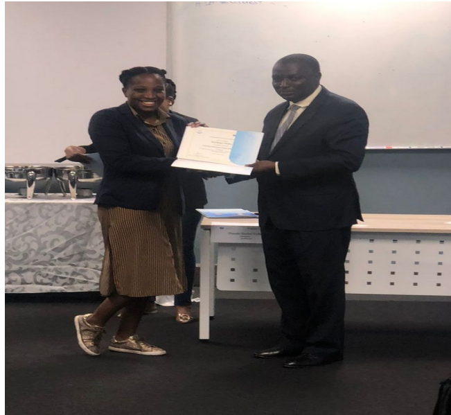
4. Certificates award ceremony

SADC member states are encouraged to utilize these newly trained SASO instructors to fulfil their training obligations while keeping the costs minimal.