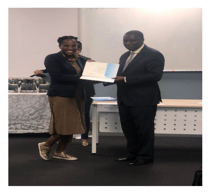
4. Certificates award ceremony

6. showing a positive and proactive attitude for their own continuous performance improvement.