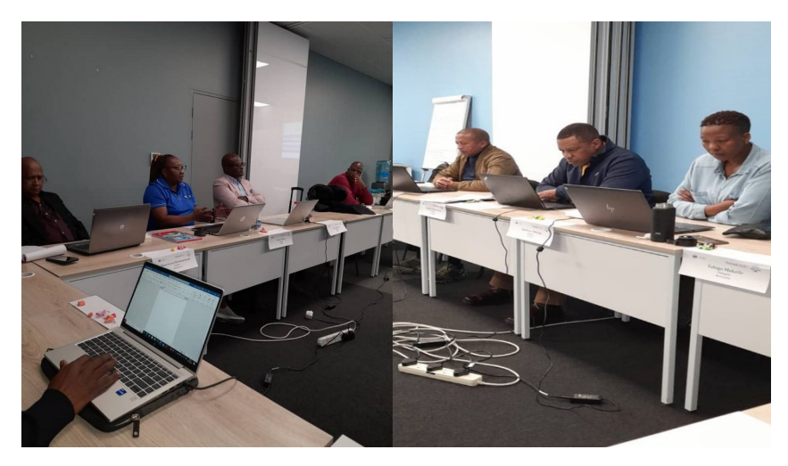
3. Participants in class

The in-person training at the ATNS Aviation Training Academy was the second part of the two components that the NSI inspectors completed. The first part, TIC-1, was a 30-hour online course which served as a pre-requisite for TIC-2.