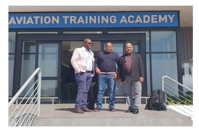
2. Participants at the ATNS entrance

In the quest for capacity building in the SADC region, ten (10) SADC Aviation Safety Organisation (SASO) National Safety Inspectors (NSI), from the various aviation domains, attended an ICAO Training Instructors Course (TIC-2) at Air Traffic and Navigation Services (ATNS) Aviation Training Academy in Johannesburg South Africa. The course was held over a period of 5 days from 22 to 26 August 2022 funded by the European Aviation Safety Agency (EASA).